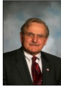
Senator Seymour, James A.