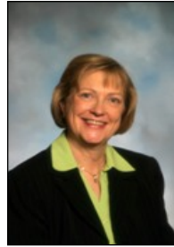
Senator Ragan, Amanda