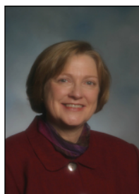
Senator Ragan, Amanda