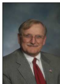
Senator Seymour, James A.