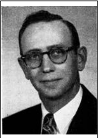
Representative Hagedorn, Merle W.