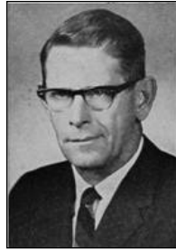
Representative Welden, Richard W.