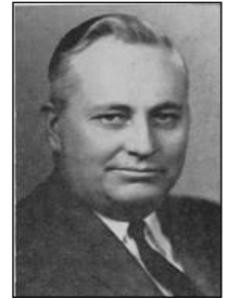
Representative Camp, John