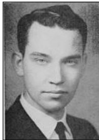
Representative Grassley, Charles E.