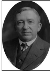
Senator Foscett, Herbert Inghram