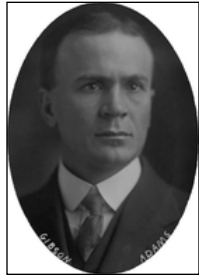
Senator Gibson, Benjamin J.