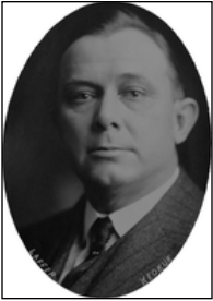
Senator Laffer, Charles C.