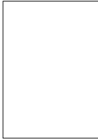
Senator Hughes, Lawson B.