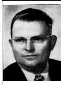
Representative Goode, Dewey Emmitt