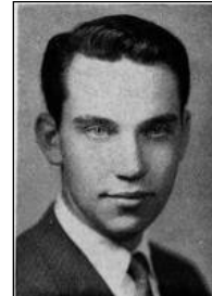
Representative Grassley, Charles E.