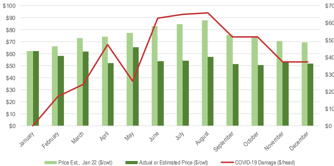
Estimated Price Loss in Iowa's Hog Markets - As of May 15, 2020