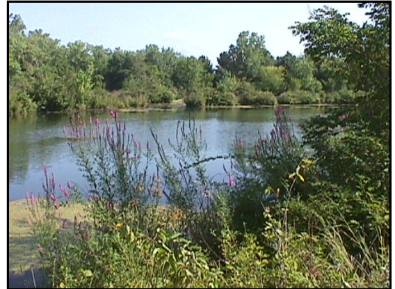
Banner Wildlife Management Area Fishing Pond

The DNR began planning the renovation of the Banner Wildlife Management Area in 2002. The purpose of the renovation was to create a viable recreation area offering a variety of activities to encourage additional people to use the Area. Upon completion of the renovation, the Area will be renamed in order to create a new identity, and the DNR will provide full-time seasonal enforcement staff to discourage unfavorable activities.