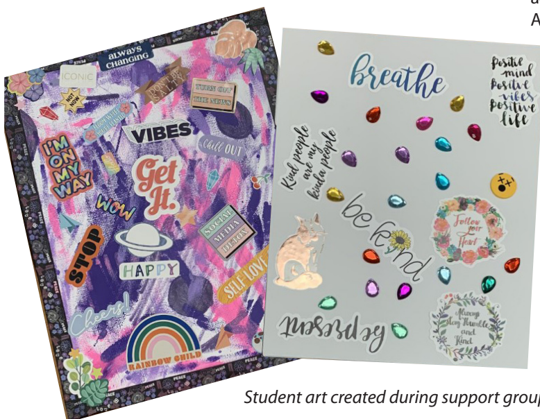
Student art created during support groups