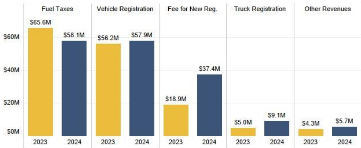
January Distributions by Revenue Source FY 2023 vs FY 2024

Note: Year-over-year difference may not match the narrative description due to rounding.